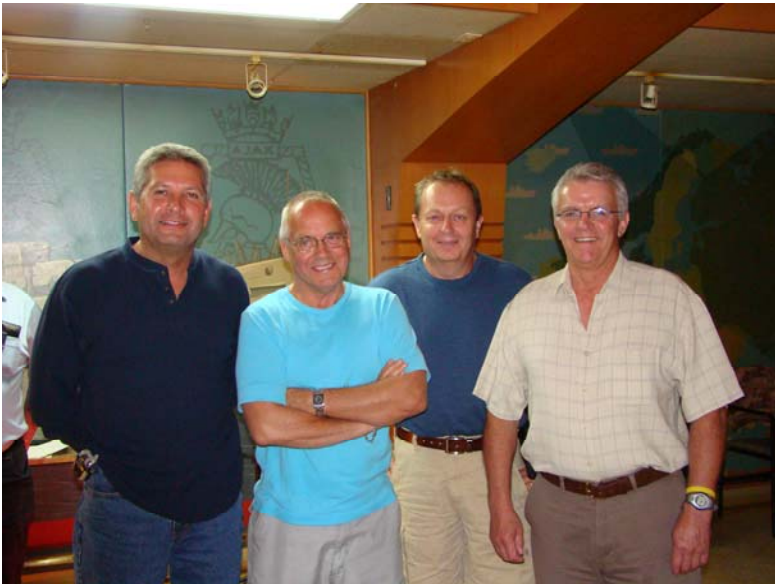
Chili cook off judges