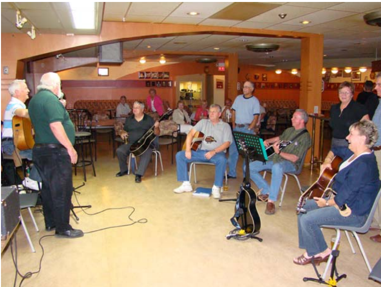
Our first Jam session